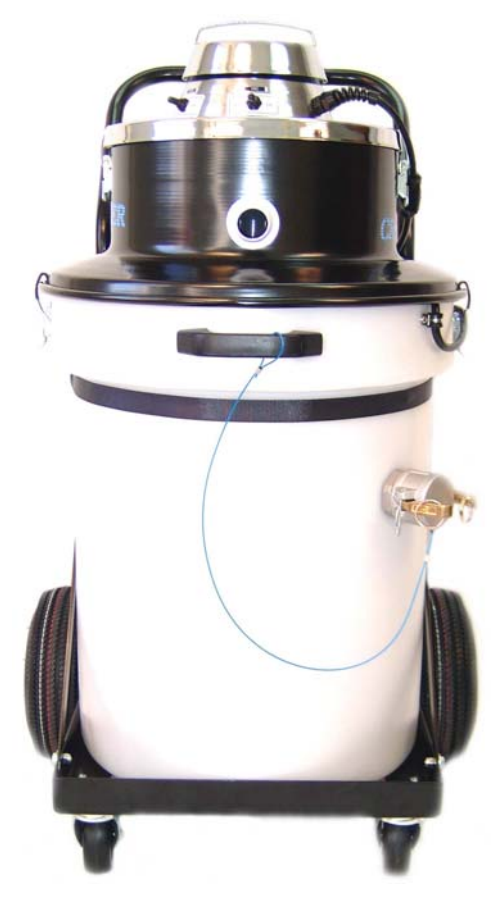
M1050-30-PUMP Shown above

The Crusader 30 Gallon Continuous Pump-out Vacuum is great for pumping into a containment truck or tank outside while you continue to work inside. This vacuum can pump while you vacuum, or can pump when you're done vacuuming. The pump-out vacuum is great for pumping down one or more flights of stairs instead of trying to wheel a vacuum tank full of concrete slurry down a stairs. Save on workers compensation from employees hurting their backs while lifting heavy barrels full of concrete slurry - PUMP IT OUT!